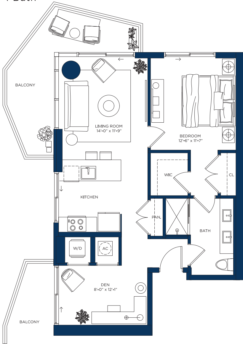
D - LEVEL 23