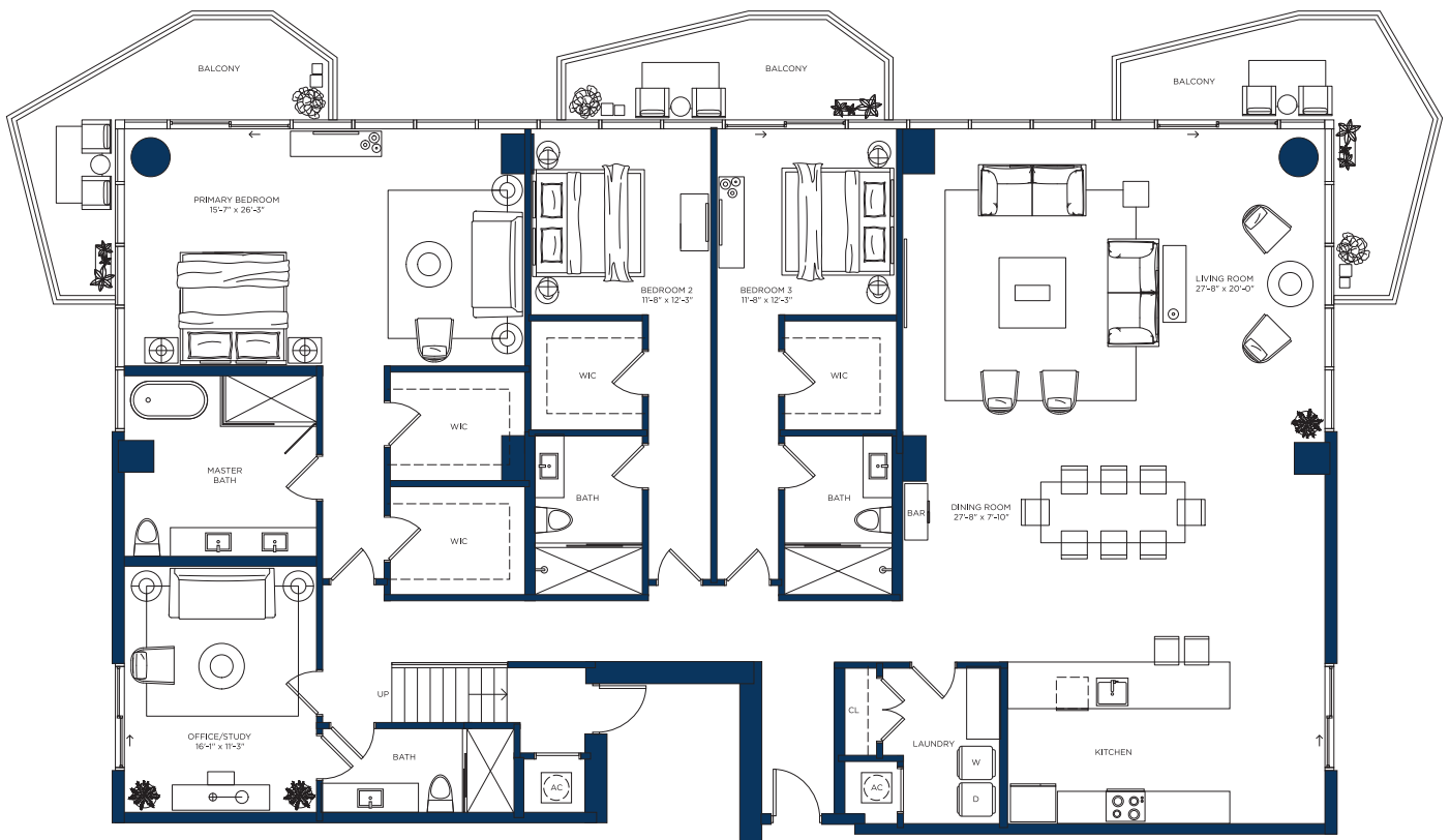
A - LEVEL 24