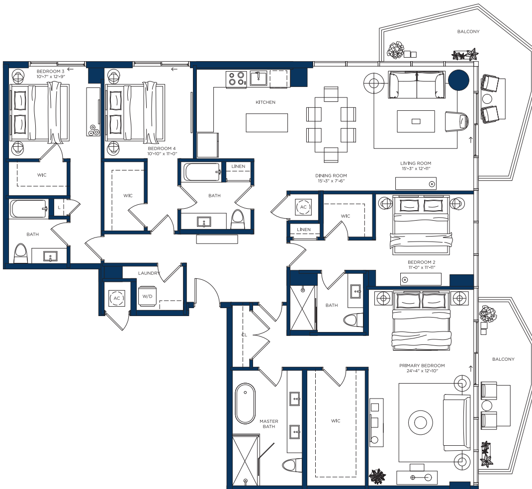
D - LEVEL 23